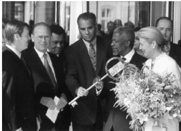
Handing-over of the key of the Headquarters Building

HAMBURG. The ceremony for the official handing-over of the new Headquarters Building of the Tribunal in Nienstedten, Hamburg, was held on Monday, 3 July 2000. It was the joint ceremony of the International Tribunal for the Law of the Sea, the Government of the Federal Republic of Germany and the Senate of the Free and Hanseatic City of Hamburg, held in the presence of the Secretary-General of the United Nations, His Excellency Mr. Kofi Annan. The building was designed and constructed for the Tribunal by the Host Country, the Federal Republic of Germany and the Host City, the Free and Hanseatic City of Hamburg.