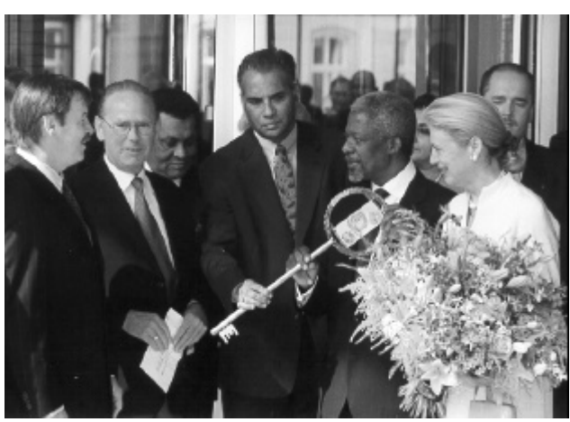
Handing-over of the key of the Headquarters Building

HAMBURG. The ceremony for the official handing-over of the new Headquarters Building of the Tribunal in Nienstedten, Hamburg, was held on Monday, 3 July 2000. It was the joint ceremony of the International Tribunal for the Law of the Sea, the Government of the Federal Republic of Germany and the Senate of the Free and Hanseatic City of Hamburg, held in the presence of the Secretary-General of the United Nations, His Excellency Mr. Kofi Annan. The building was designed and constructed for the Tribunal by the Host Country, the Federal Republic of Germany and the Host City, the Free and Hanseatic City of Hamburg.